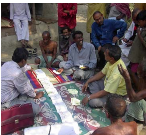
CIFRI staff collecting information on seasonal land use in Tangramary village in West Bengal, a village with many small brackish water rice-fish systems.