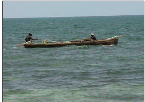
A seine net in a canoe with fishers in Jamaica

The people of the wider Caribbean region are facing a crisis. Coastal communities are finding livelihoods and food supply threatened due to resource overexploitation, declining environmental health, habitat degradation, and increased conflicts among various users. The countries of the Caribbean confront difficult problems in coastal and marine management. The need for new approaches is urgent. More holistic perspectives and co-management of coastal and marine resources linking officials, communities and NGOs are increasingly seen as solutions.