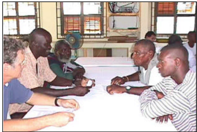
CaMMP staff, fishers and community members considering fisheries co-management in Barbados

To find out more about CaMMP, and our projects throughout the region, please see our website at www.caribbeanconservation.org , or contact CaMMP's Senior Program Officers: