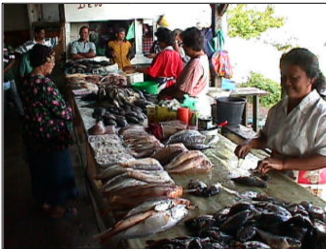
Fresh and smoked fish on sale at a market in Suriname

responded to the current situation in March of 2001 with the establishment of the Coastal and Marine Management Program (CaMMP) , an initiative focused on conserving coastal and marine resources through improved management. The CCA and CaMMP are drawing on over 35 years of experience in the region and a membership pool including most Caribbean governments, 400 individuals and 80 NGOs.